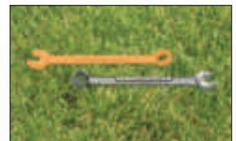
Painting your tools helps them "pop out" in the grass

Have you ever finished filling an excavation and then remembered that you left a wrench or shovel in the hole? Or found that a black wrench lying in tall grass is hard to find, if not forgotten? We all have.