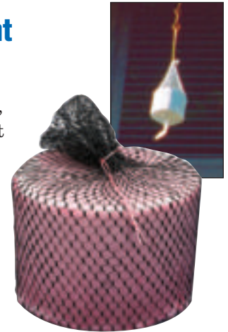
These 20-lb deodorant blocks dissolve in air

Masking agents mask the funky odors with a pleasant scent (cherry, pine, etc). Our most popular masking agents are 20-pound deodorant blocks which are air-activated and gradually dissolve over 12 to 14 weeks.