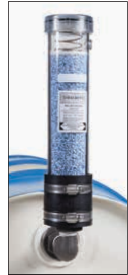
Refillable Cartridge 350895