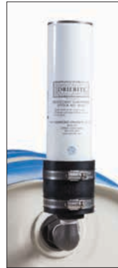
Disposable Cartridge 350894