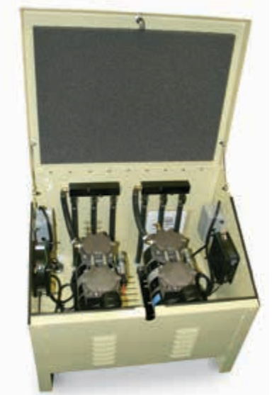
System with Floor-Mount Cabinet (shown open)