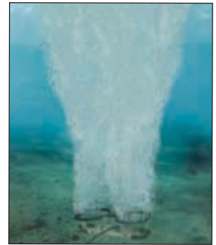
Aerator in action (52774 shown)