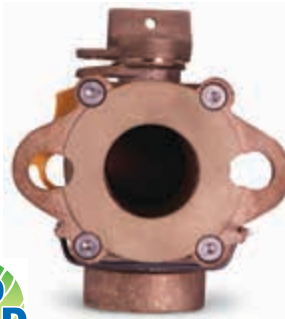
Front View (99925)