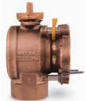
Side View (99925)