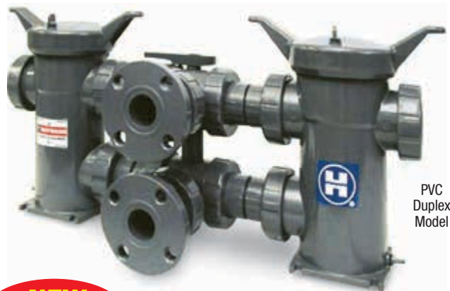
PVC Duplex Model