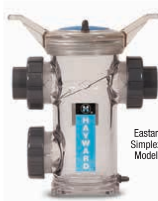
Eastar Simplex Model