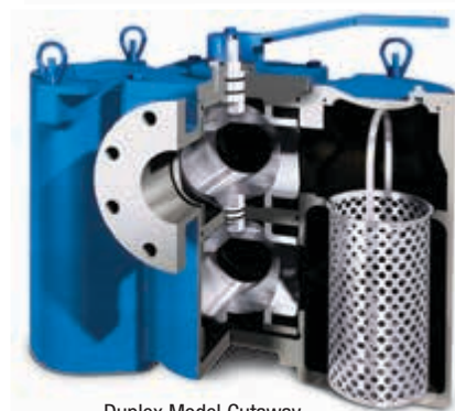
Duplex Model Cutaway