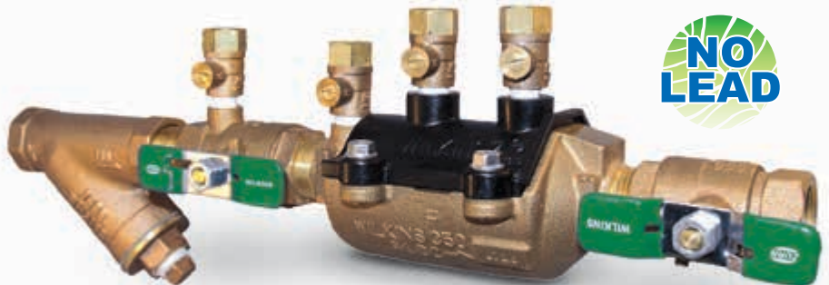
350XLS Double Check Backflow Preventer