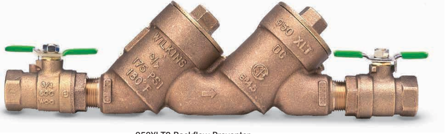
950XL T2 Backflow Preventer (without strainer)