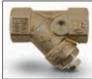
Watts LF777SI Series Wye Strainer 58885

Max working pressure: 175 psi Temperature range: 33 to 110°F continuous, 140°F intermittent