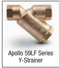
Apollo 59LF Series Y-Strainer