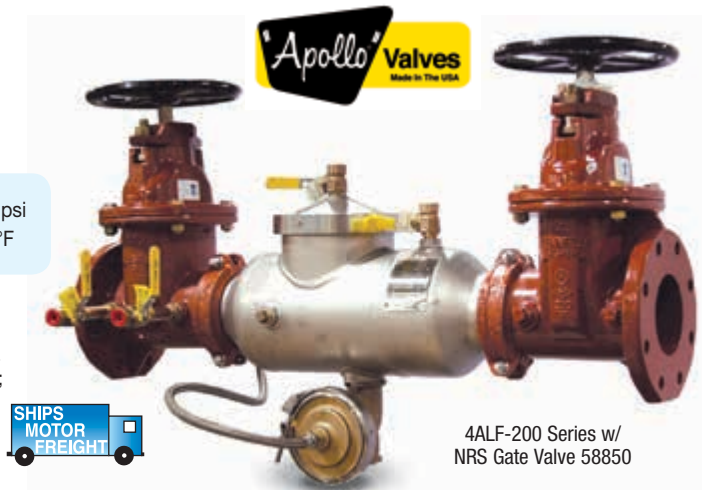
4ALF-200 Series w/ NRS Gate Valve 58850

Max working pressure: 175 psi Max temperature: 140°F