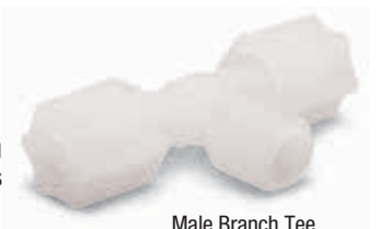
Male Branch Tee