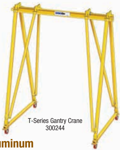
T-Series Gantry Crane 300244