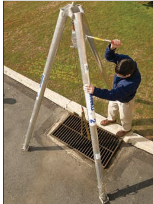
Crane with Aluminum Flat Feet 64537