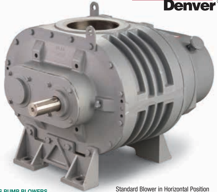
Standard Blower in Horizontal Position 67966