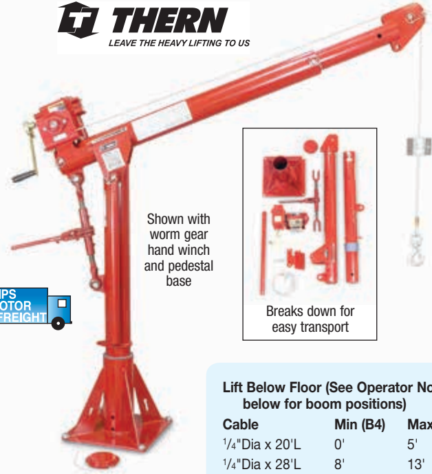
Shown with worm gear hand winch and pedestal base