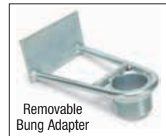
Removable Bung Adapter

See page 1669 for our USABlueBook Mixer Selection Guide.