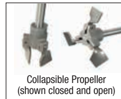
Collapsible Propeller (shown closed and open)