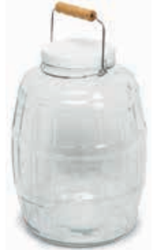
2.5-Gallon Glass Bottle with Lid 28828