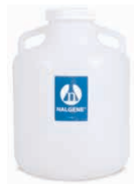
2.5-Gallon PE Bottle with Cap 28826