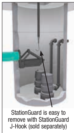
StationGuard is easy to remove with StationGuard J-Hook (sold separately)

Two-piece design features a basket with mounting cradle that's easy to maintain once installed. Just use the J-hook and handle (sold separately) to remove, empty and replace basket. Spacings on basket can be adjusted in 1/2" increments depending on the size of the objects you're trying to catch.