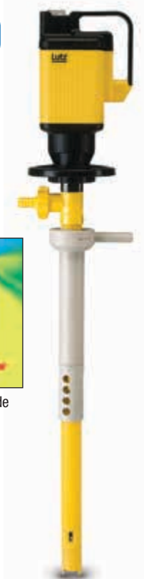
Mixing pump tube shown with B55T-5 motor