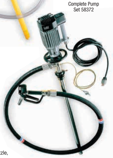
Complete Pump Set 58372