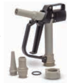
Polypro Nozzle 72742

Use optional dispensing nozzles to stop flow momentarily without having to shut off your pump. Hose barb connections feature a swivel.