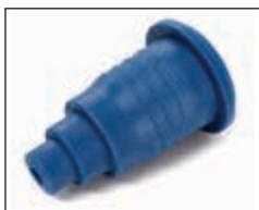
Plastic tubes feature trimmable hose barb.

Pump tubes handle specific gravities up to 1.8. Choose from 40" or 48" length. 40" tubes are recommended for use with 55-gallon drums. Unique foot and impeller housing design allow easy servicing. Polypropylene, PVDF and SS models all feature a 1" discharge hose barb. PP and PVDF hose barbs offer flow steps that let you limit your maximum flow. PP and PVDF tubes also include hose and cord storage clips.