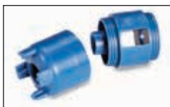
Easily serviceable foot design.

Pump motors are available as electric or air-powered. All handle viscosities up to 500 cP. Electric motors include a 12' L power cord and come in three types: ODP (open drip proof), TEFC (totally enclosed fan cooled), or explosion proof. Use TEFC motors for applications with corrosive fumes. Explosion proof motors must be used with a stainless steel pump tube and static protection kit 72945 for hazardous duty applications.