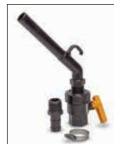
Polypro Dispensing Nozzle 72850