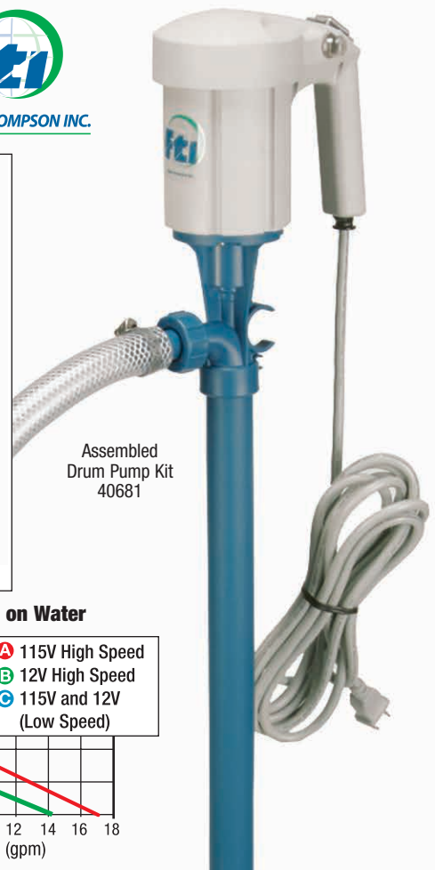
Assembled Drum Pump Kit 40681