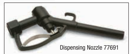
Dispensing Nozzle 77691