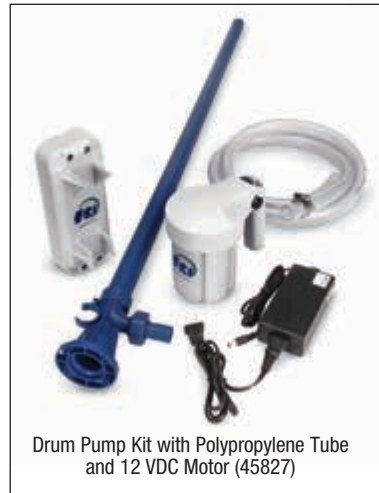
Drum Pump Kit with Polypropylene Tube and 12 VDC Motor (45827)