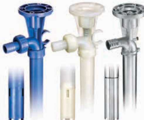
Pump Tubes (left to right): Polypropylene, PVDF, Stainless Steel

Polypropylene and PVDF tubes feature an inlet strainer for protection from debris and particulate.