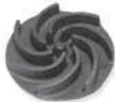
Non-clogging Vortex-Type Impeller