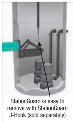
StationGuard is easy to remove with StationGuard J-Hook (sold separately)

Two-piece design features a basket with mounting cradle that's easy to maintain once installed. Just use the J-hook and handle (sold separately) to remove, empty and replace basket. Spacings on basket can be adjusted in 1/2" increments depending on the size of the objects you're trying to catch.