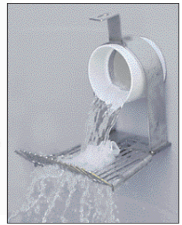
Water passes through—but wipes and rags don't!