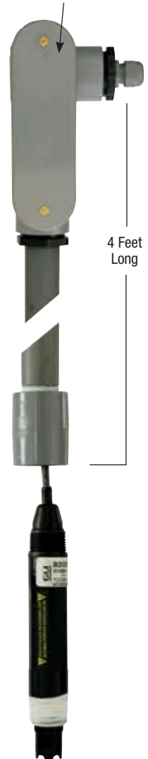
4 Feet Long

Immersion Mounting Hardware 28027 is an economical solution for simple immersion mount applications.