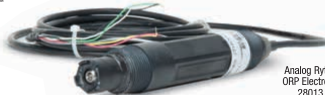
Analog Ryton ORP Electrode 28013

Rugged, rebuildable probes for GLI & Hach controllers