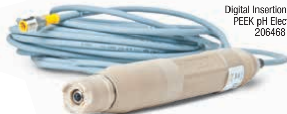
Digital Insertion-Mount PEEK pH Electrode 206468