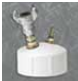
Air-Loc® Conversion Kits - Sewer Air Testing

Accessories & Conversion Kits Available with Big Mouth® Plugs