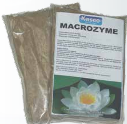
8 oz. water soluble bags