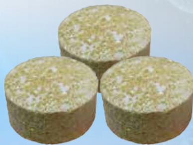
Muck Pucks Each puck 1" diameter x 5/8" tall