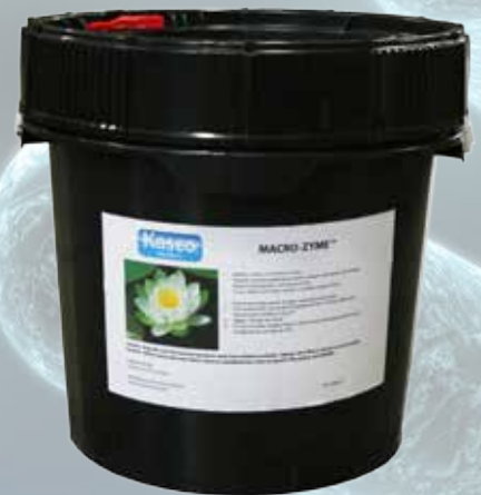
25# or 50# bulk pail