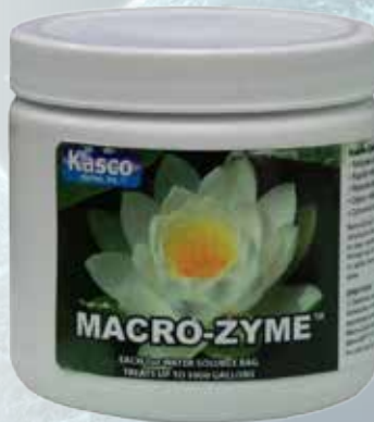
Jar of 6 packs of 1oz. bags